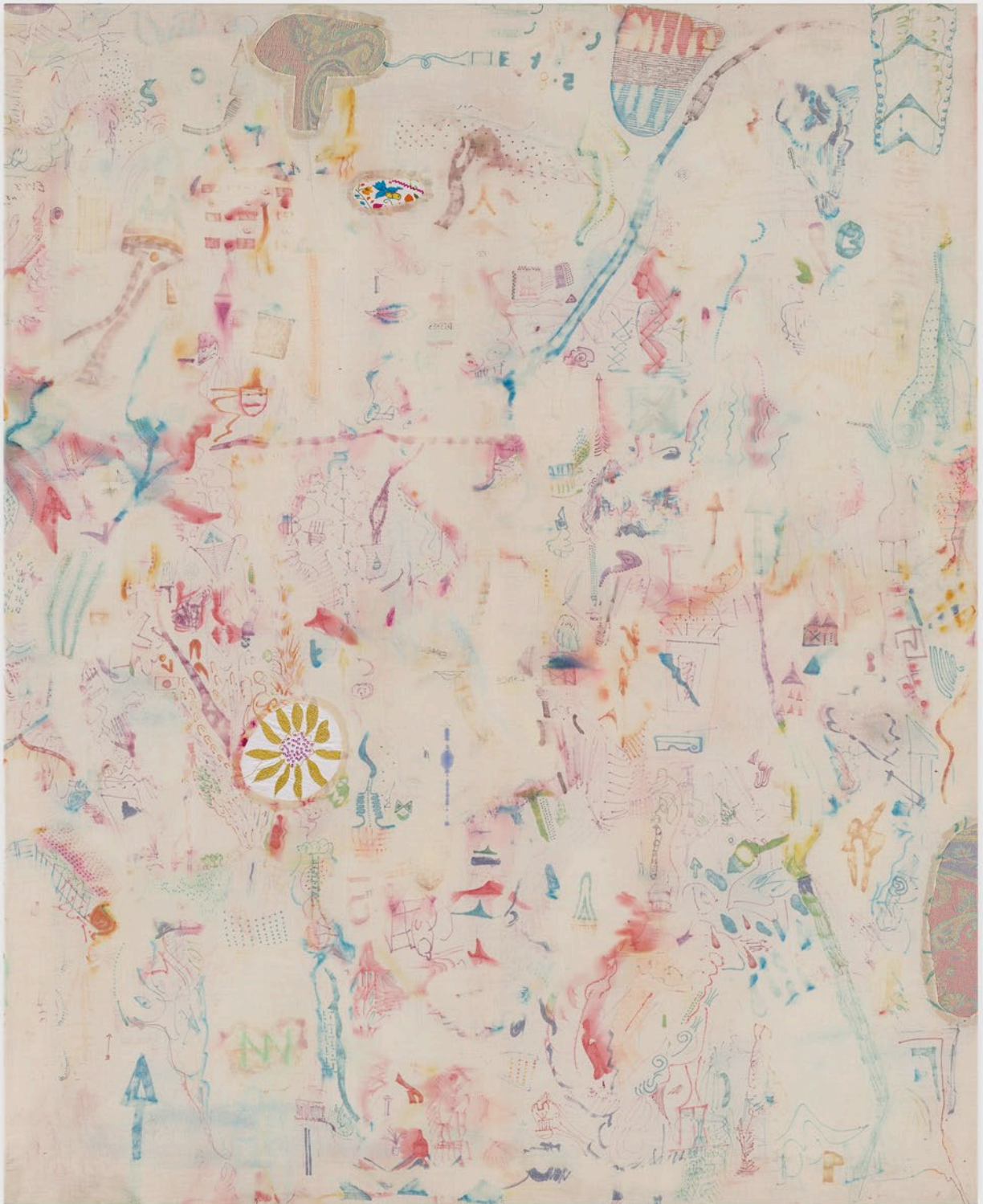
Jasper Baydala, Stone Zone, 2018 Permanent marker, felt tip, embroidery on bleached canvas, 160 x 130 cm