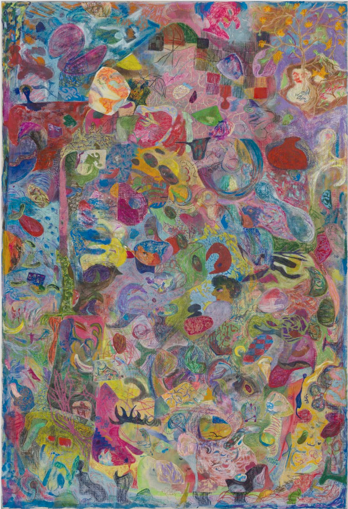
Max Brand, Untitled, 2018 Chalk pastel, watercolour, permanent marker, acrylic paint, 190 x 130 cm, MBr/2018/pai/19271