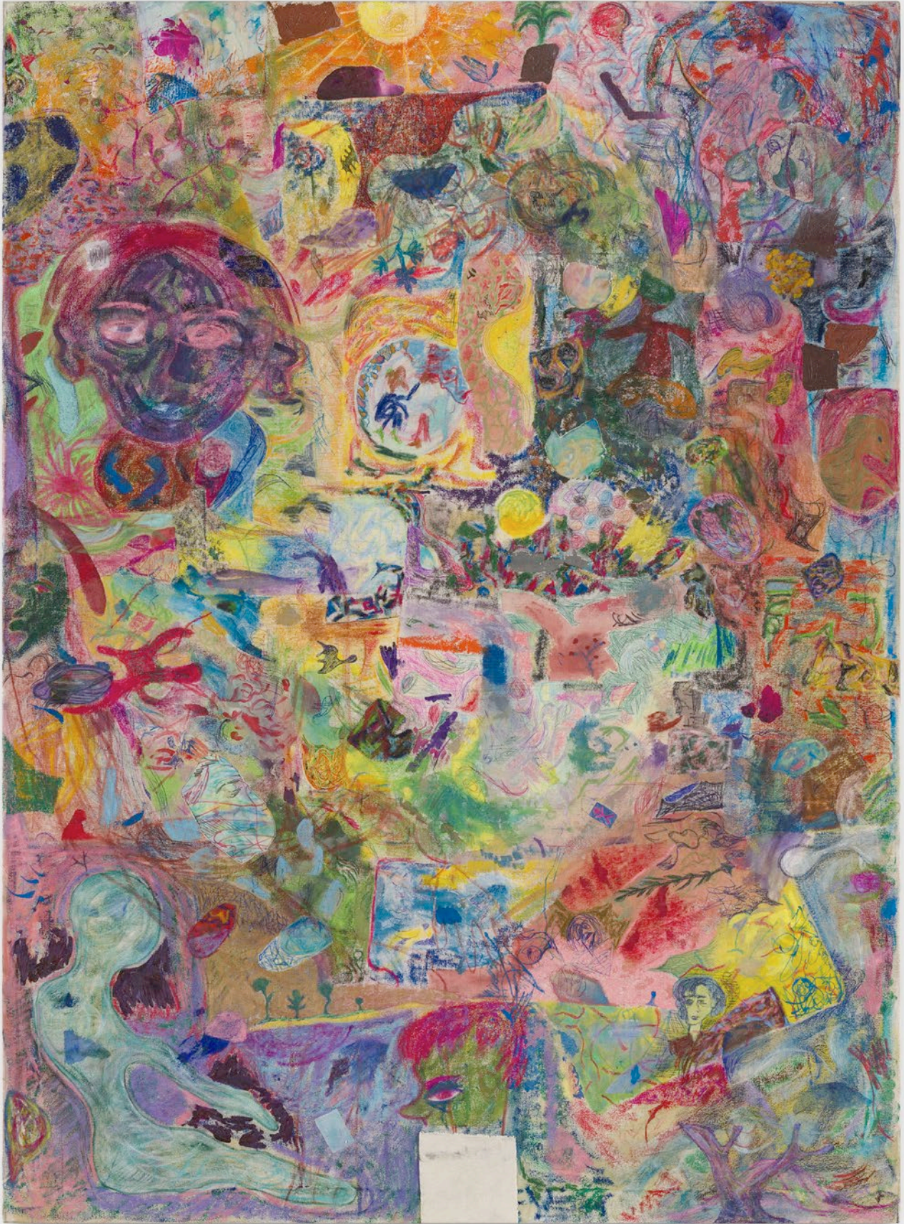
Max Brand, Untitled, 2018 Chalk pastel, watercolour, permanent marker , acrylic paint, 190 x 140 cm, MBr/2018/pai/19273