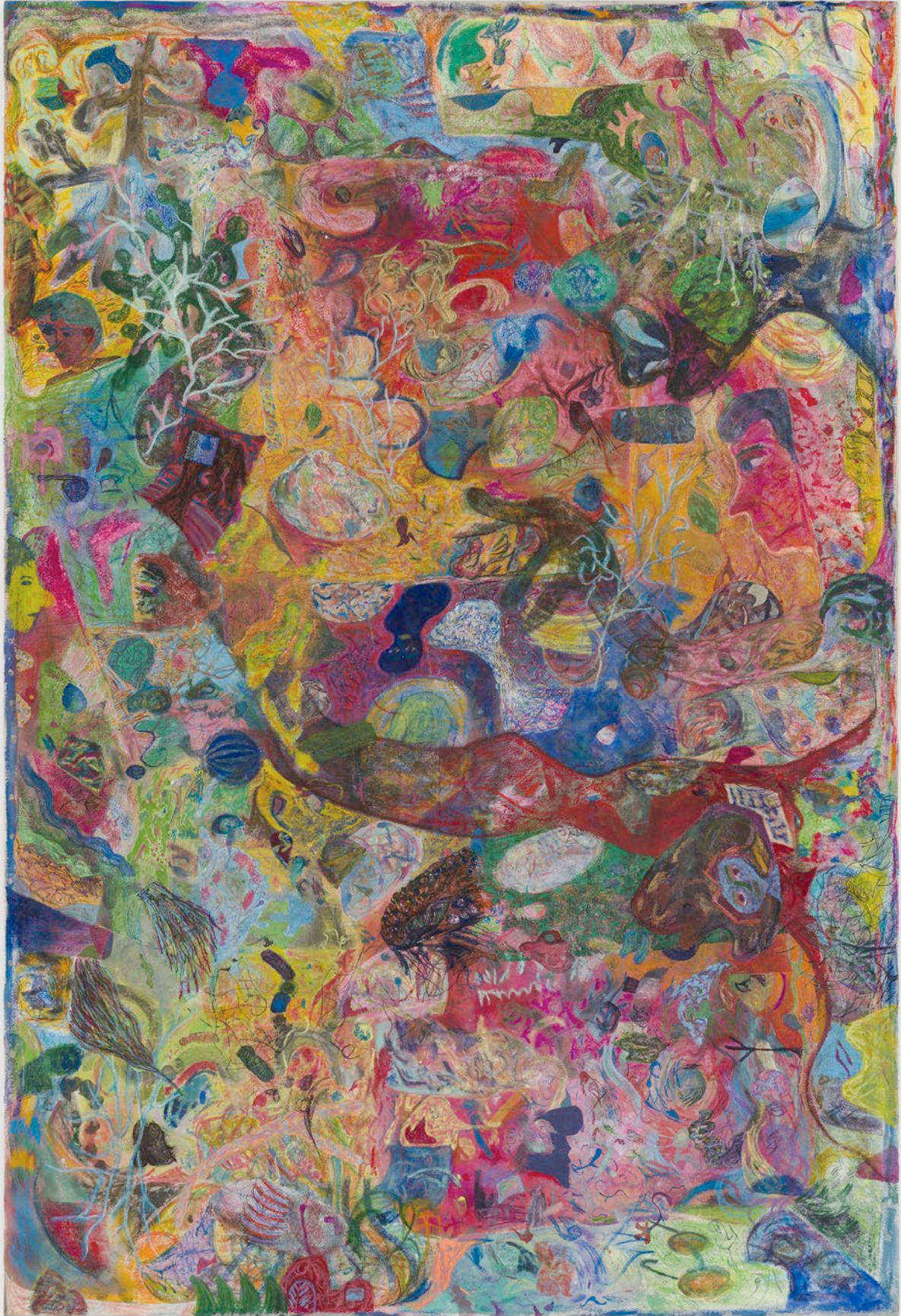
Max Brand, Untitled, 2018

Chalk pastel, watercolour, permanent marker , acrylic paint, 220 x 150 cm, MBr/2018/pai/19272