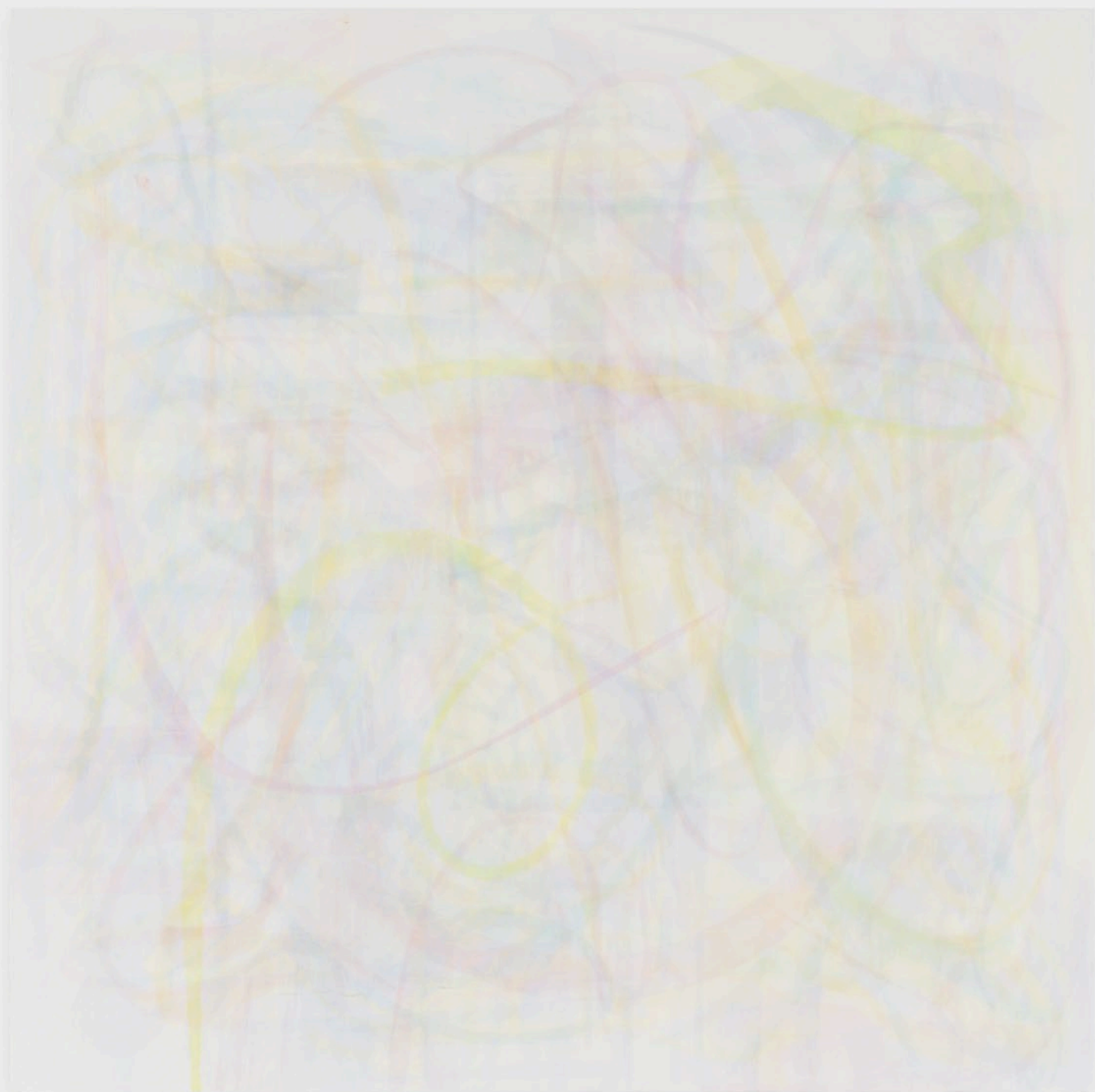
Jasper Baydala, Abba Father, 2018 Oil on canvas, 180 x 180 cm