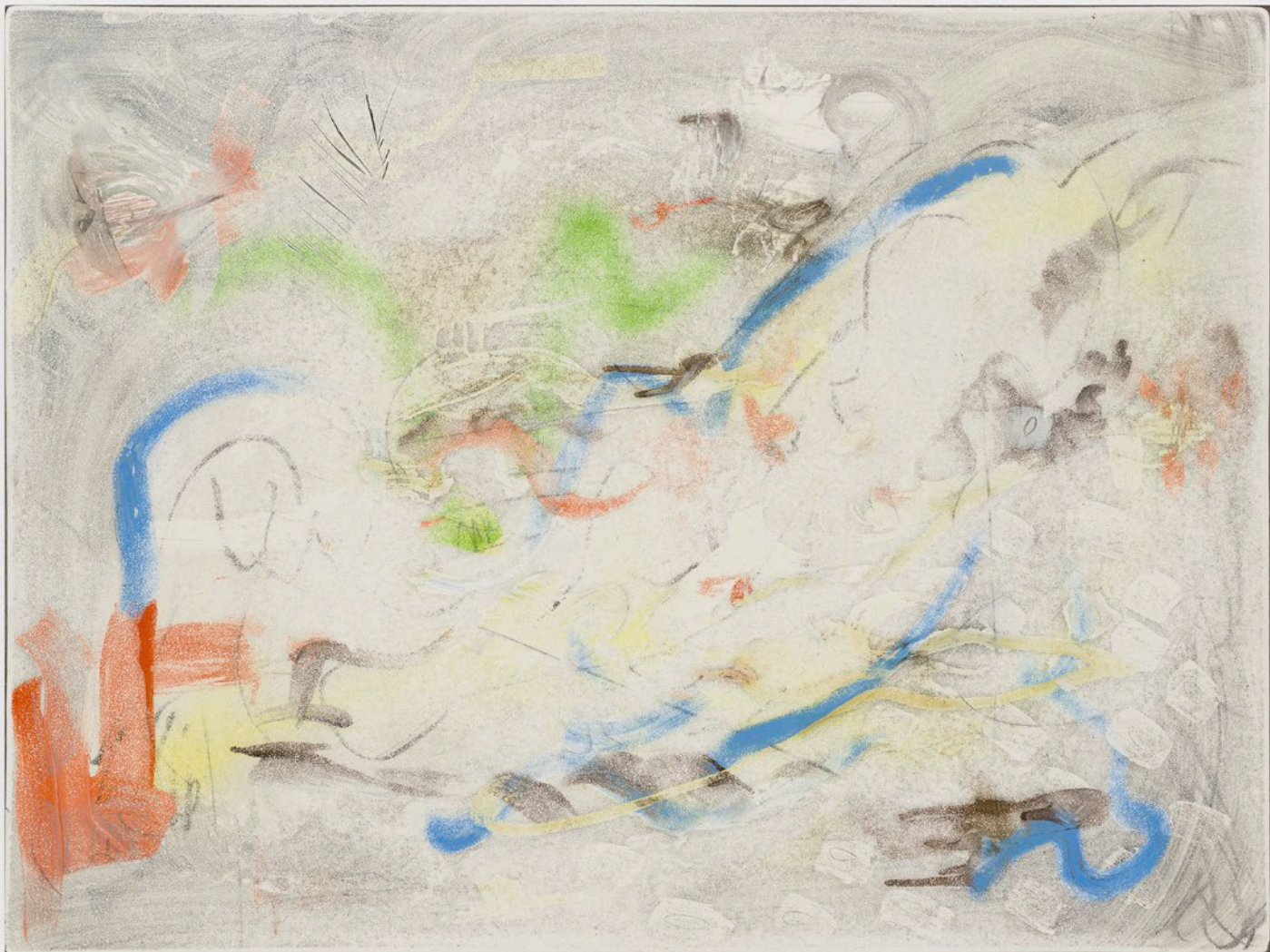
Jasper Baydala, Herodotus, 2017 Oil on board, finished with sandpaper, 45,7 x 61 cm