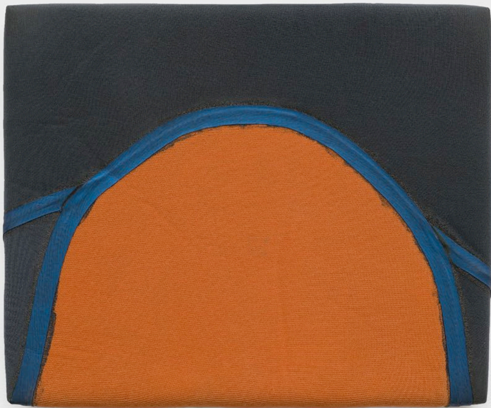
Jasper Baydala, Wetsuit, 2018 Wetsuit cut, 25 x 31 x 3 cm